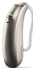
Bolero M-PR Available Fall 2019