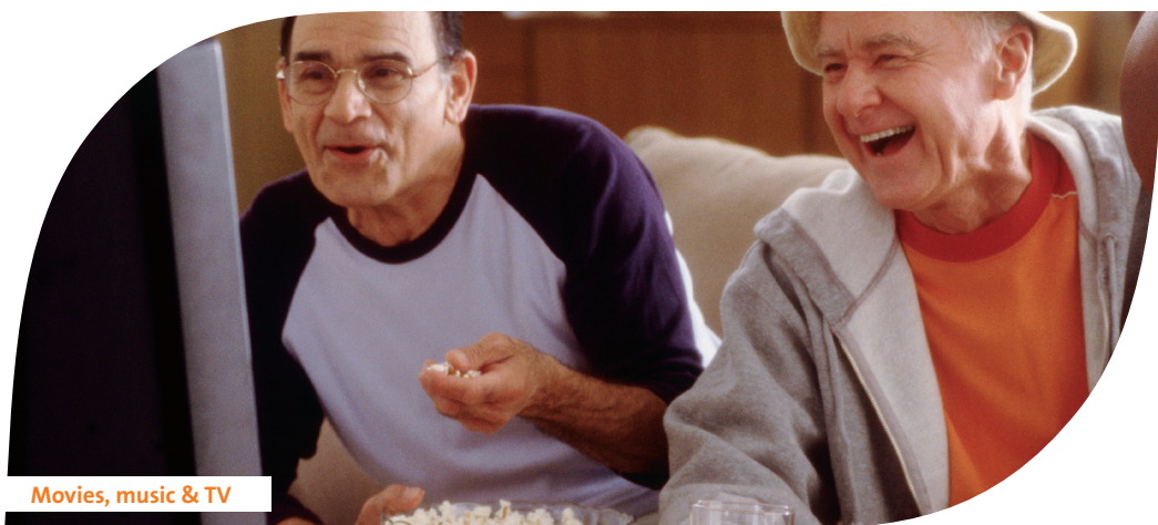
Movies, music & TV

No matter where you are or what you're doing, MicroLens is designed to make listening easier. It's the ideal hearing aid for people who are active and on the go, enjoy spending relaxing time at home — or both.