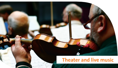
Theater and live music