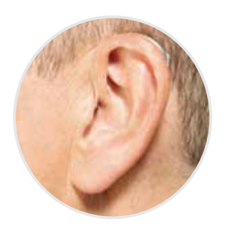
Summit iQ is available in a variety of styles and colors for your ideal fit.

If you have severe to profound hearing loss, ask your hearing professional about Summit iQ Power Plus BTE 13.