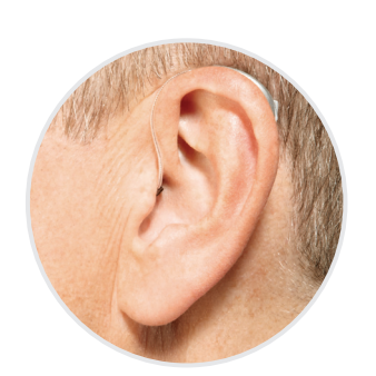
Muse iQ is available in a variety of styles and colors for your ideal fit.

If you have severe to profound hearing loss, ask your hearing professional about Muse iQ Power Plus BTE 13.