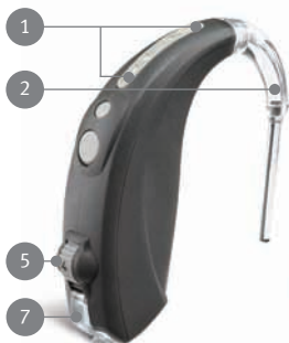
Transmitter HI (poor ear)